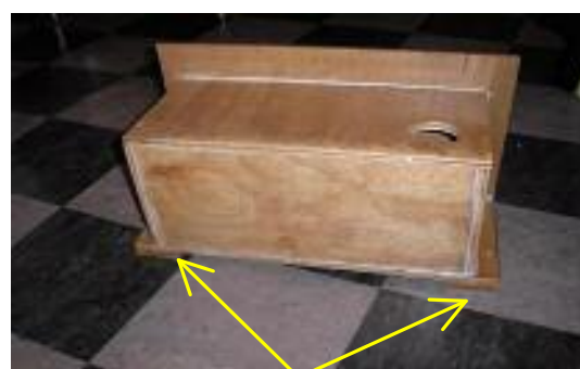
Bottom of the box, showing the battens that offset the back from the wall