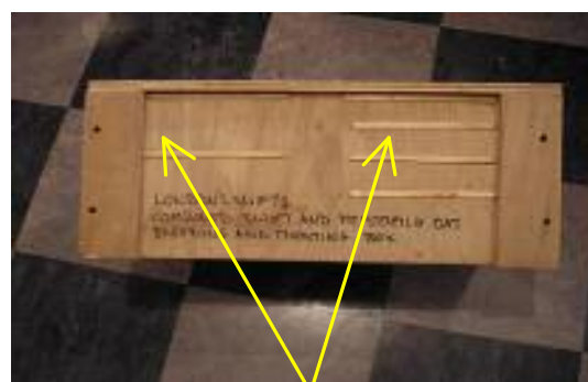
Back view showing bat roosting area

NB make sure the back of the box's roof is sealed against the wall with mastic to prevent rainwater entering the bats' roosting area.